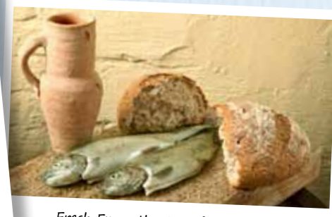
Fresh From the Sea of Galilee