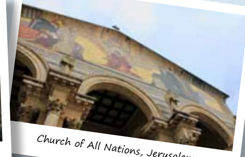
Church of All Nations, Jerusalem

mosaics in the Church of the Loaves and Fishes. Ascending the Mt. of Beatitudes, we listen to Jesus' teachings. On an ancient trade route, we pass Hazor and then go on to Tell Dan. Here we do a nature walk and visit the high place where Jeroboam son of Nebat set up a golden calf. We continue to Caesarea Philippi (Banias), where Peter answered Jesus' question, "Who do you say that I am?" Our route then takes us over the Golan Heights, skirting Mt. Hermon, with a view toward Damascus. We end the day with a boat ride on the Sea of Galilee.