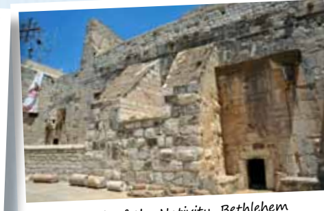
Church of the Nativity, Bethlehem