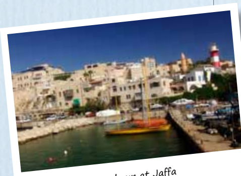
Old Harbour at Jaffa

We drive along the Sea of Galilee to Capernaum, where we visit the synagogue and the place where early Christians remembered Peter's house. We continue to Tabgha (short for Heptapagon, "seven springs") to view the