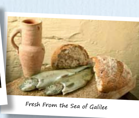
Fresh From the Sea of Galilee