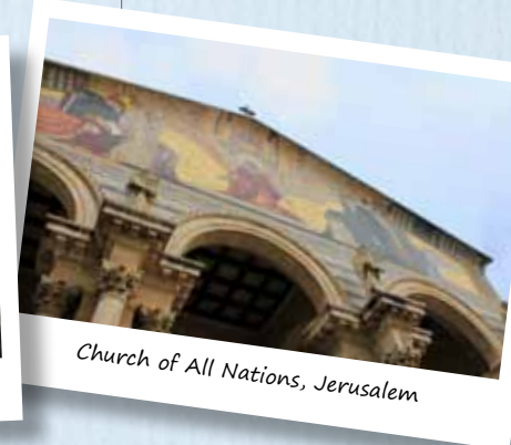
Church of All Nations, Jerusalem