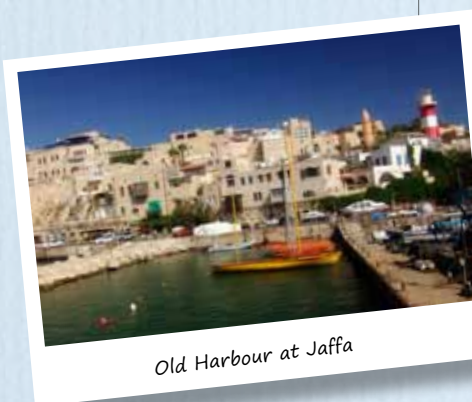
Old Harbour at Jaffa

After breakfast, we drive through Ein Gedi to visit the fortress Masada, rising 1,200 feet above the desert plain. We see the restoration efforts of remains of buildings dating back to the fourth and fifth centuries AD. Afterward, those who wish may enjoy a "float" in the Dead Sea. We then view Qumran where a Bedouin shepherd found the Dead Sea Scrolls